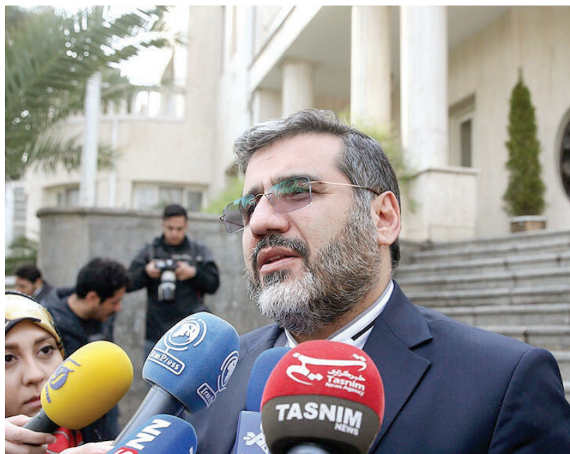
image by circulating rumors about the festival's boycott by artists and cinema lovers. Esmaeili

IRNA – Iran's Culture and Islamic Guidance Minister Mohammad-Mehdi Esmaeili said that holding the Fajr Film Festival in 31 Iranian provinces aims to bring happiness to the society. The minister made the statement on the sidelines of the cabinet meeting on Wednesday. During his recent visit to the secretariat of the festival, he said that successful international films have so far been submitted to the secretariat. Speaking on this year's festival, he said that this year, the festival's organizers have a special look at underprivileged regions, and mobile cinemas will be vastly available in these areas. He noted that some foreign-based media have tried to ruin the upcoming Fajr Film Festival's