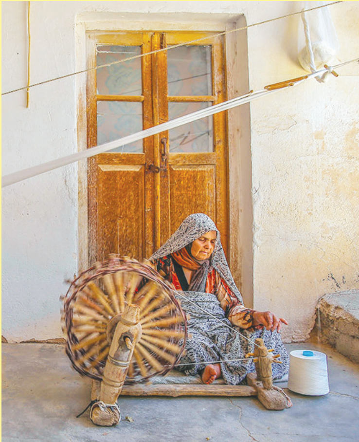
The photos, released on January 1, 2023, show women weaving cloths and towels in South Khorasan Province's Khorashad Village, known for its textiles as cultural heritage.

decent run in Qatar, where he scored twice, registered one assist and made nine key passes – a sum that only eight players could surpass in the entire tournament. The Iranian was tipped for a move to a host of big European clubs in the summer – including Serie A champion Milan, and London archrivals Arsenal, Chelsea, and Spurs – and reports have suggested in recent weeks that Arsenal might be willing to renew its interest in Taremi as Gunners' boss Mikel Arteta is looking for a short-term replacement for Brazilian frontman Gabriel Jesus, who faces some time on the sidelines after sustaining a knee injury while on international duty in Qatar. When asked by renowned Iranian journalist Adel Ferdosipour in July if he fancies a future outside the Portuguese league, Taremi said: "That's up to the club. I should take club's priorities into account before making any decision."