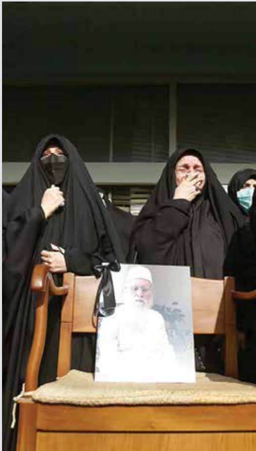
People from the capital city of Tehran attend the funeral ceremony of the deceased mystic Haj Hossein Ghanbari on December 22, 2022.

In the middle of breathtaking mountains and forests, Babak Castle lies as an impressive relic. This stone fortress is over 1,200 years old. The two-hour climb to the castle will bless you with great views. But don’t forget to wear comfortable shoes and take enough water. You will definitely fall in love with this legendary and mysterious place.